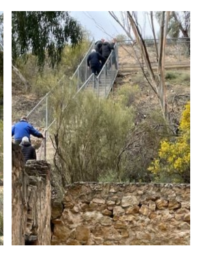
And this one!